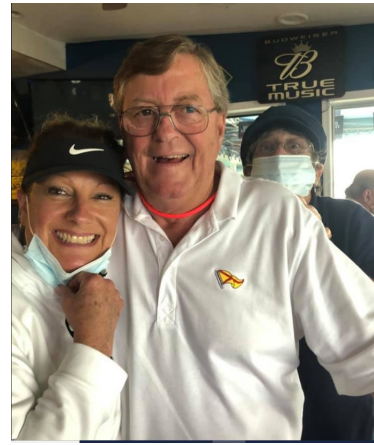
PHOTO BOMB