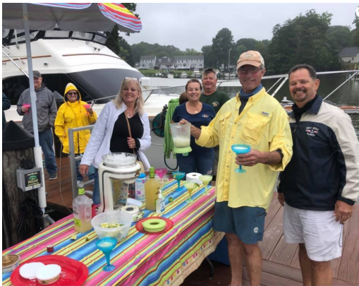
HAZELL'S MARGARITAS PIER