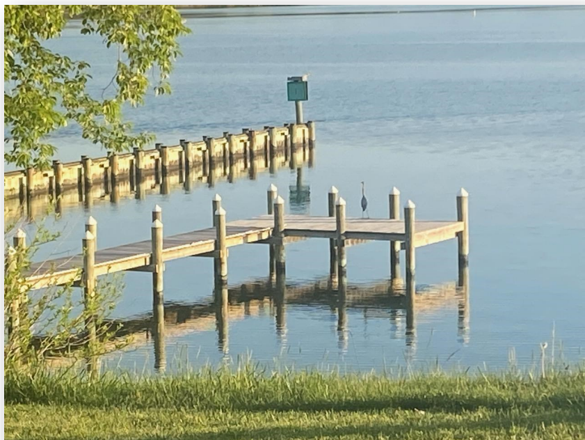
Great Blue Heron on the Commodore's dock