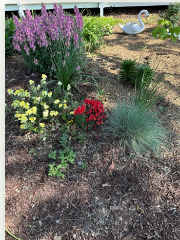
Spanish perennial Snapdragons, annual snapdragons, and lovely yellow native flowers, with Little Bluestem grass.