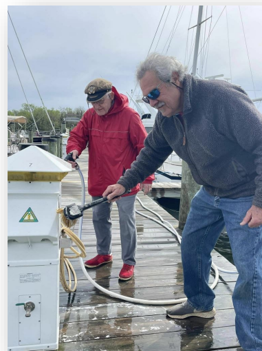
2024 Spring Cleanup